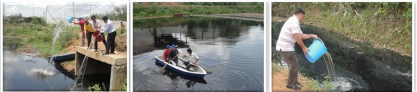
Right: Treatment With iQPR Technology Begins on 7 June 2010