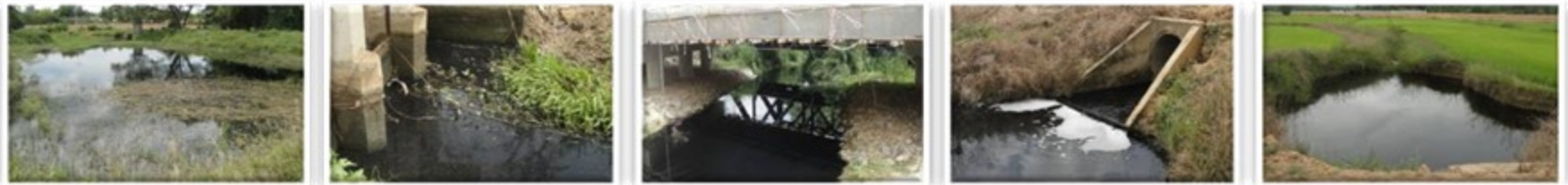
Above: Situation In The Flood Retention Pond And Sungai Kok Mak On 7 June 2010 – Before Treatment